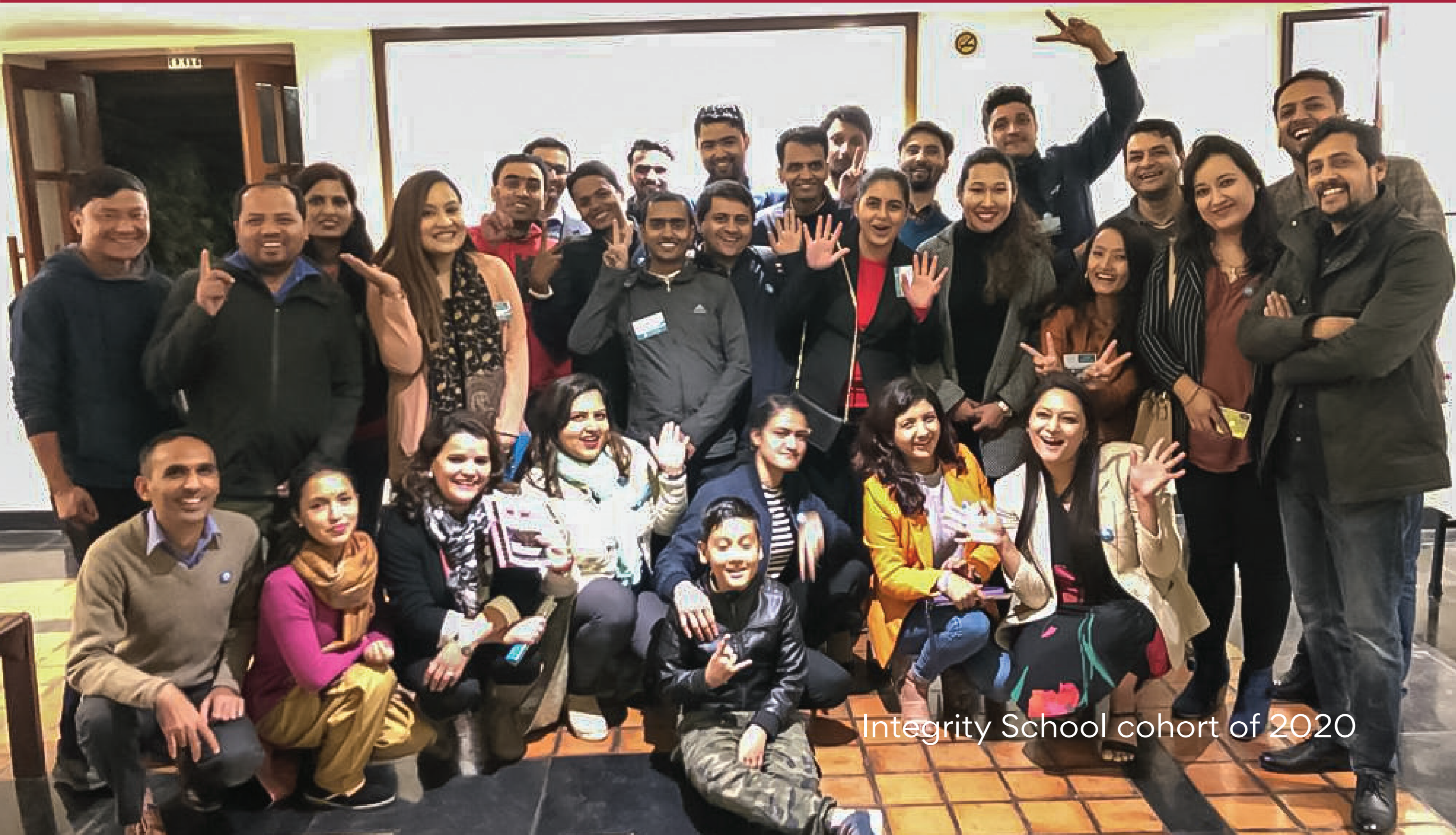
Integrity School cohort of 2020